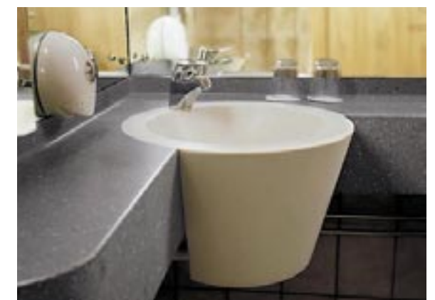
RADISSON SAS ROYAL VIKING HOTEL, STOCKHOLM, SWEDEN. DESIGN SNICKARBOLAGET. VANITY TOP AND BOWL IN CORIAN® CAMEO WHITE AND CORIAN® GRAY FIELDSTONE.

LEFT VANITY TOP AND BOWL IN CORIAN® GLACIER WHITE AND CORIAN® GRAVEL. DESIGN RENAUD HEYMANS.