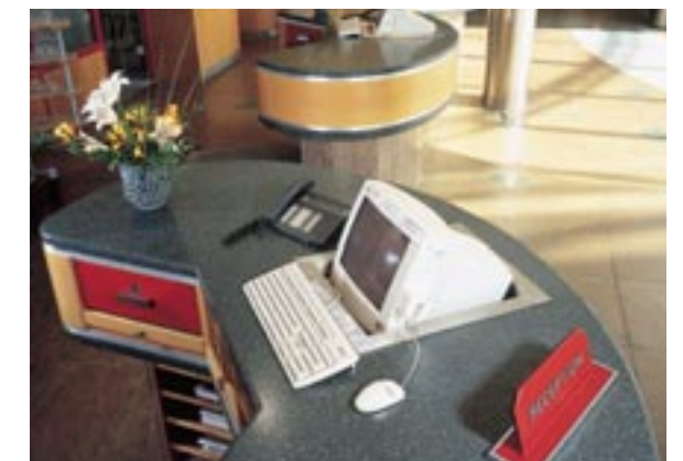
MÖVENPICK HOTEL, OBERURSEL, GERMANY. THREE ROUND RECEPTION DESKS IN CORIAN® RAIN FOREST COMBINED WITH WOOD.