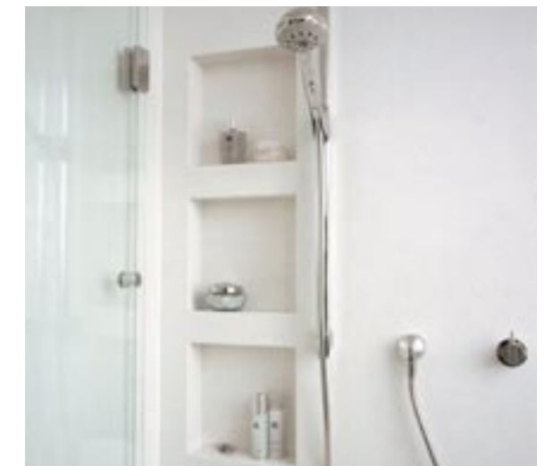
CORIAN® SHOWER WALLS WITH FITTED SHELVES. DESIGN CHARLES ZÄCH.