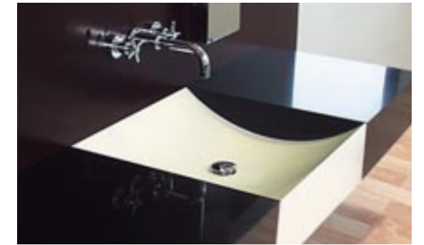
"ZEN" VANITY, MILANO, ITALY. DESIGN MASSIMO FUCCI. VANITY IN CORIAN® NOCTURNE AND CORIAN® BONE.

Corian® also combines beautifully with wood, stainless steel or glass to create original units. Whether you opt for a revitalising shower or a relaxing bath, Corian® ensures an unforgettable experience.