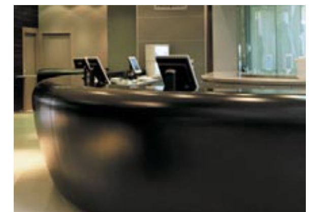
ENTRANCE OF THE LAGUNA PALACE HOTEL, MESTRE, ITALY. DESIGN STUDIO MARCO PIVA.