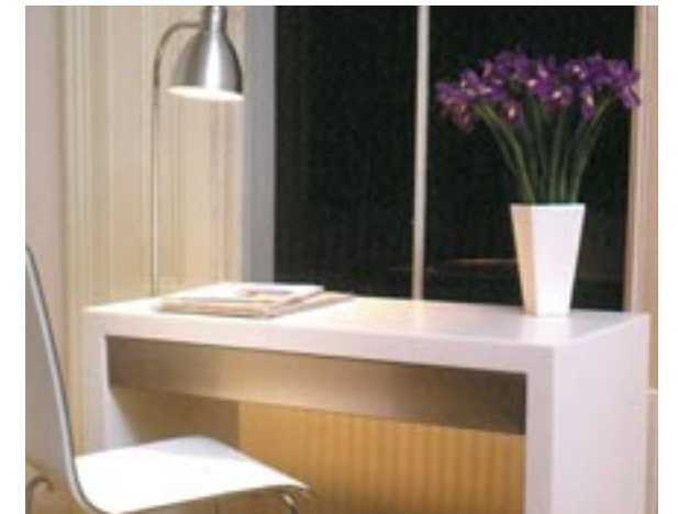
"TABLESTORE", LONDON, UNITED KINGDOM. DESIGN ADRIAN WRIGHT. BRILLIANT SLAB COLLECTION IN CORIAN® GLACIER WHITE.